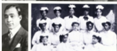
Within These Walls: A Short History of Dillard University (2000)