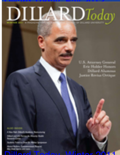
Dillard Today, Winter 2011

ALTO INSIDE: Celebrating 75 Years of History, Dillard's Great History, and more!