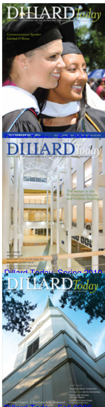
Dillard Today, Fall 2009