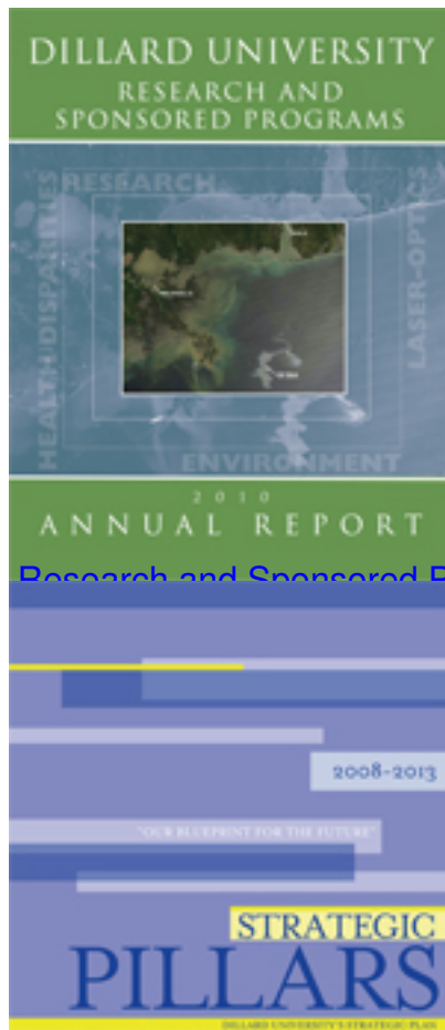
Research and Sponsored Programs, 2010 Annual Report