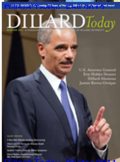
Dillard Today, Winter 2011