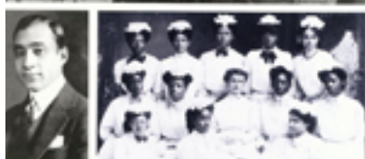
Within These Walls: A Short History of Dillard University (2000)