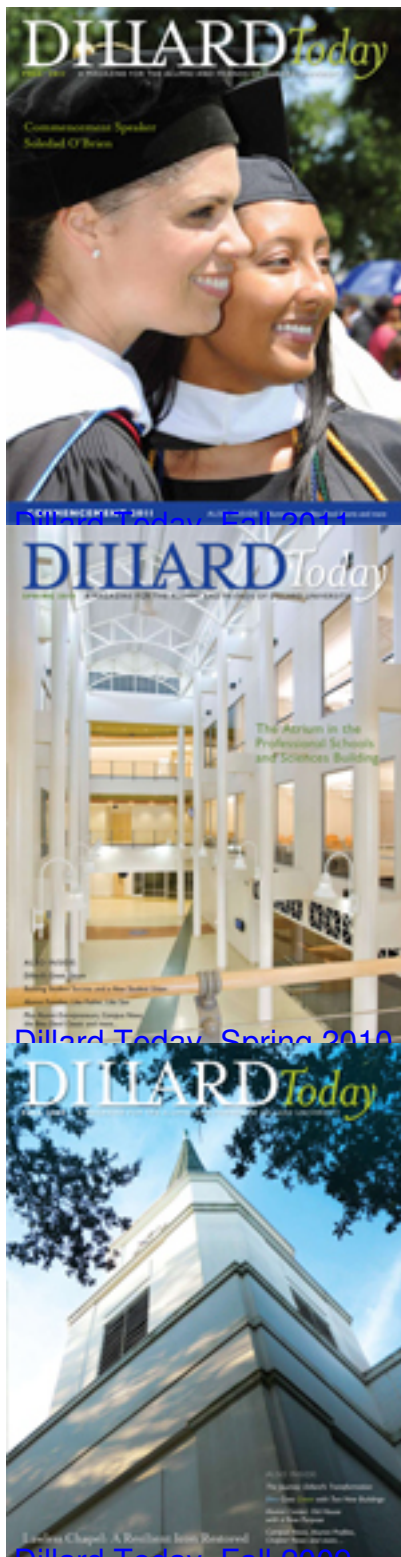
Dillard Today, Fall 2009