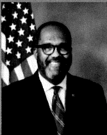
Congressman Troy A. Carter U. S. House of Representatives

Rho Phi Chapter, Omega Psi Phi Fraternity, Inc. The Omega Men Foundation N O B L E New Orleans Chapter Hills Daniels Law Firm Weightless Wonders