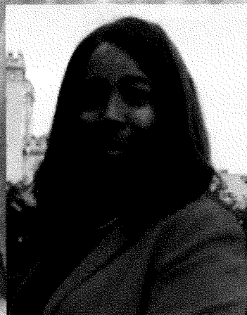
Judge Nicole Sheppard Civil District Court